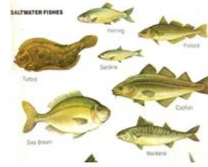
Plate 7: Salt water fishes.