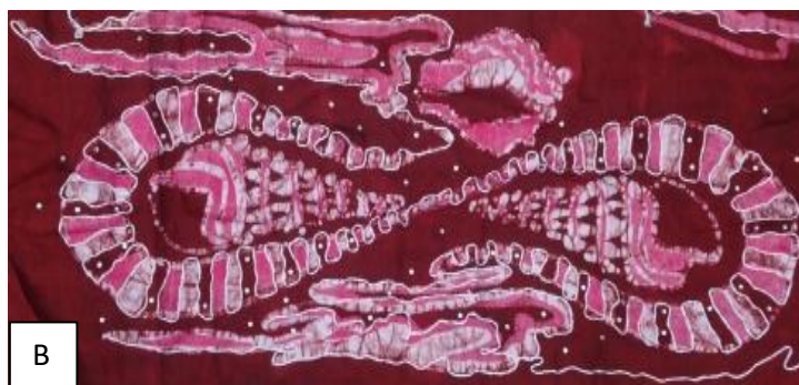
Figure 2 A & B: One unit of the full fabric design of ama kiri ikara and also used as shoulder (a representation of ikagi bite ) cloth by chiefs in the riverine communities.