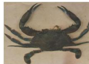
Plate 10: Salt water Crab ( Ikoli ) collected from Okpoama.