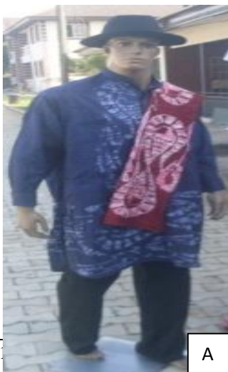
Figure 1 Artist: Pamela I. Cyril-Egware