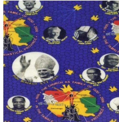
Plate 3 & 4: The commemorative cloths have become increasingly important as political tools as well as to distribute educational or public religious information.

Plate 2: This wrapper design is one of the earliest designs still used today. It incorporates fingers, coins, and hands which symbolizes a Ghanaian proverb that roughly means, "if you do it alone, you will fail, but if you work together you can make money". It also refers to the Akan proverb, "the palm of the hand where money is received is sweeter than the back of the hand."