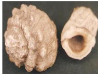
Plate 6: Dog whelk ( Egeleu Igbon ): Collected from Swamp creeks of Okpoama