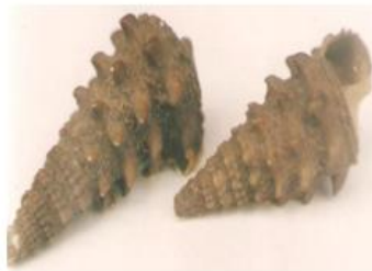
Plate 5: Periwinkle ( Ngaru Isemi )