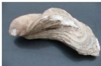
Plate 8: Oyster ( Ingba ) Collected from the Atlantic coast of Okpoama