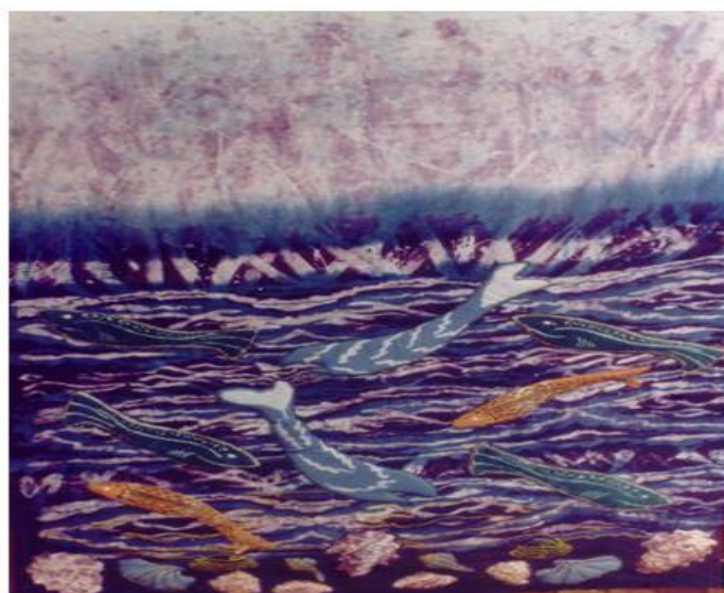
Figure:3 Artist: Pamela I. Cyril-Egware Title: Unity in Diversity Medium: Batik and applique Size: 170cm X 110cm Year of production: 2005